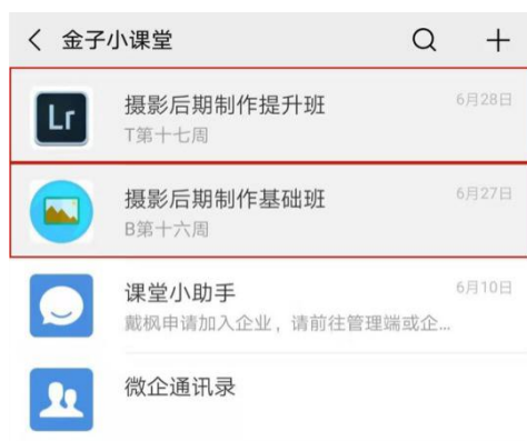
Figure 3 Self-built "Golden Small Classroom" APP

After-school review is a necessary supplement to face-to-face lessons of only 2 hours per week. Teachers use the WeChat public account platform to apply for the establishment of a WeChat enterprise account "Golden Small Classroom", and self-built 2 applications of "Basic Photography Post Production Class" and "Photographic Post Production Improvement Class" (Figure 3). In this way, all elderly students can be added to the enterprise number, and learning resources such as text, graphics, pictures, videos, and documents can be produced. The learning resources are sent to the students through group messaging. The students receive the learning resources in the smartphone "Corporate WeChat" APP.