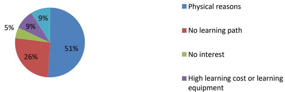
Figure 2 Main Reasons Affecting Learning to Use a Computer or Smartphone