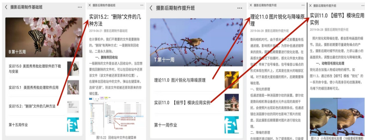
Figure 4 “Golden Classroom” Multi-graphic Review Materials